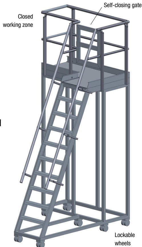
MOBILE STEP LADDERS

RISafety's Mobile Access Systems can be modified to meet your and regulatory requirements, such as open or closed working zone; custom design to avoid clashing with existing structures.